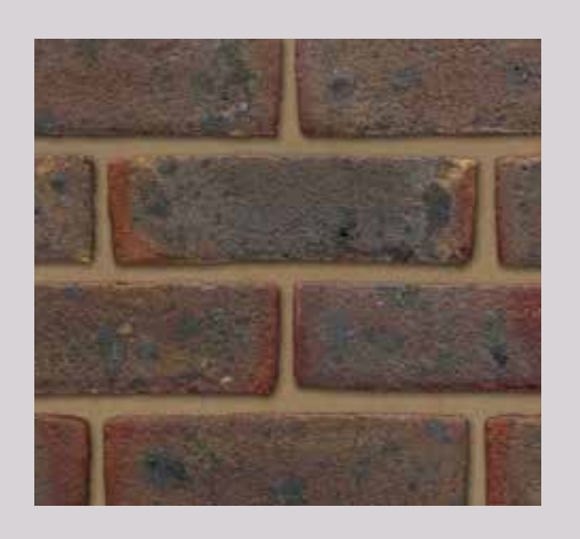
Private House, Wimbledon, Surrey