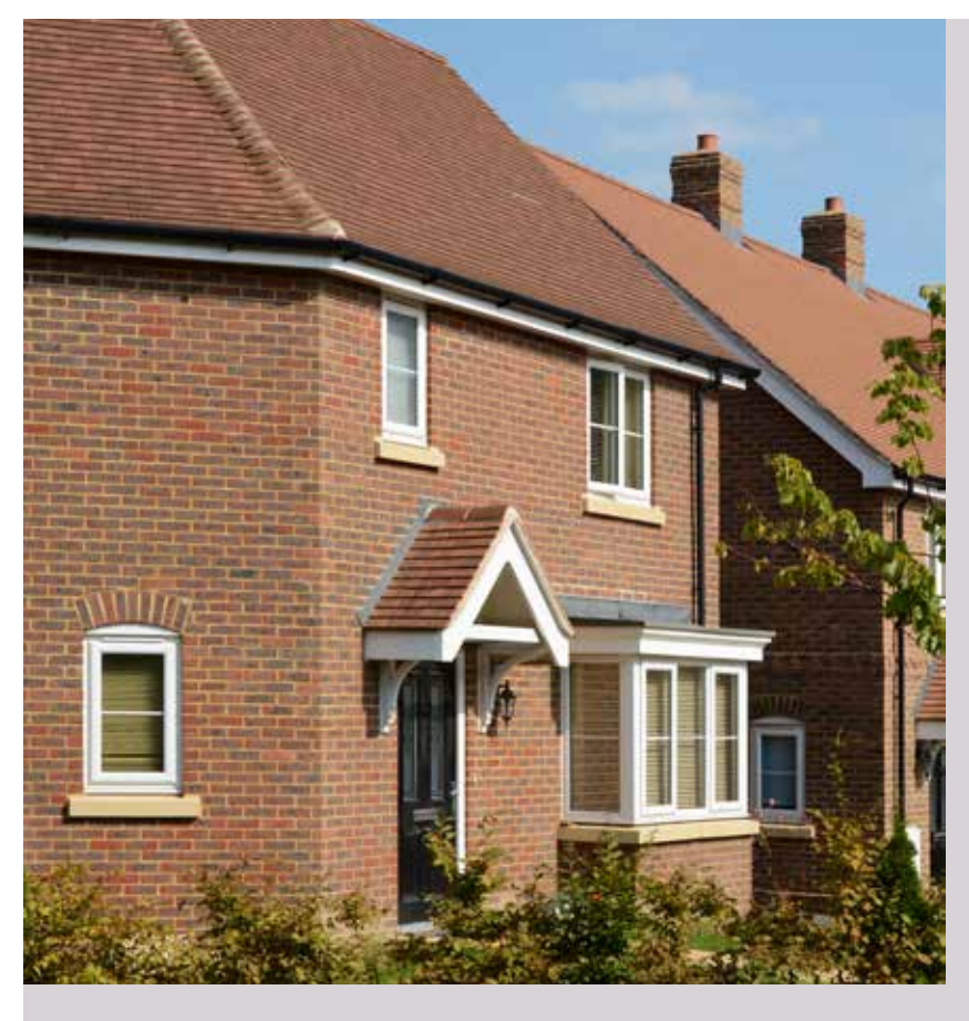
Housing, Lindfield, West Sussex