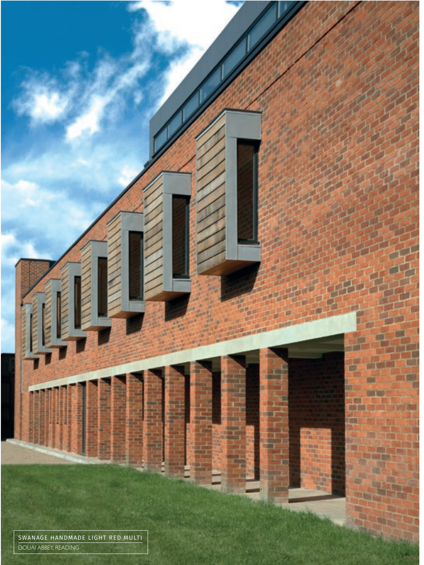
SWANAGE HANDMADE LIGHT RED MULTI DOUAI ABBEY, READING