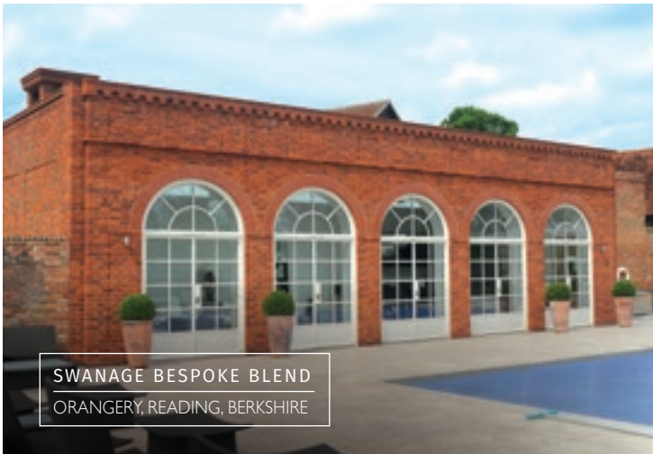
SWANAGE BESPOKE BLEND ORANGERY, READING, BERKSHIRE

BLENDS THAT SUIT EACH INDIVIDUAL PROJECT