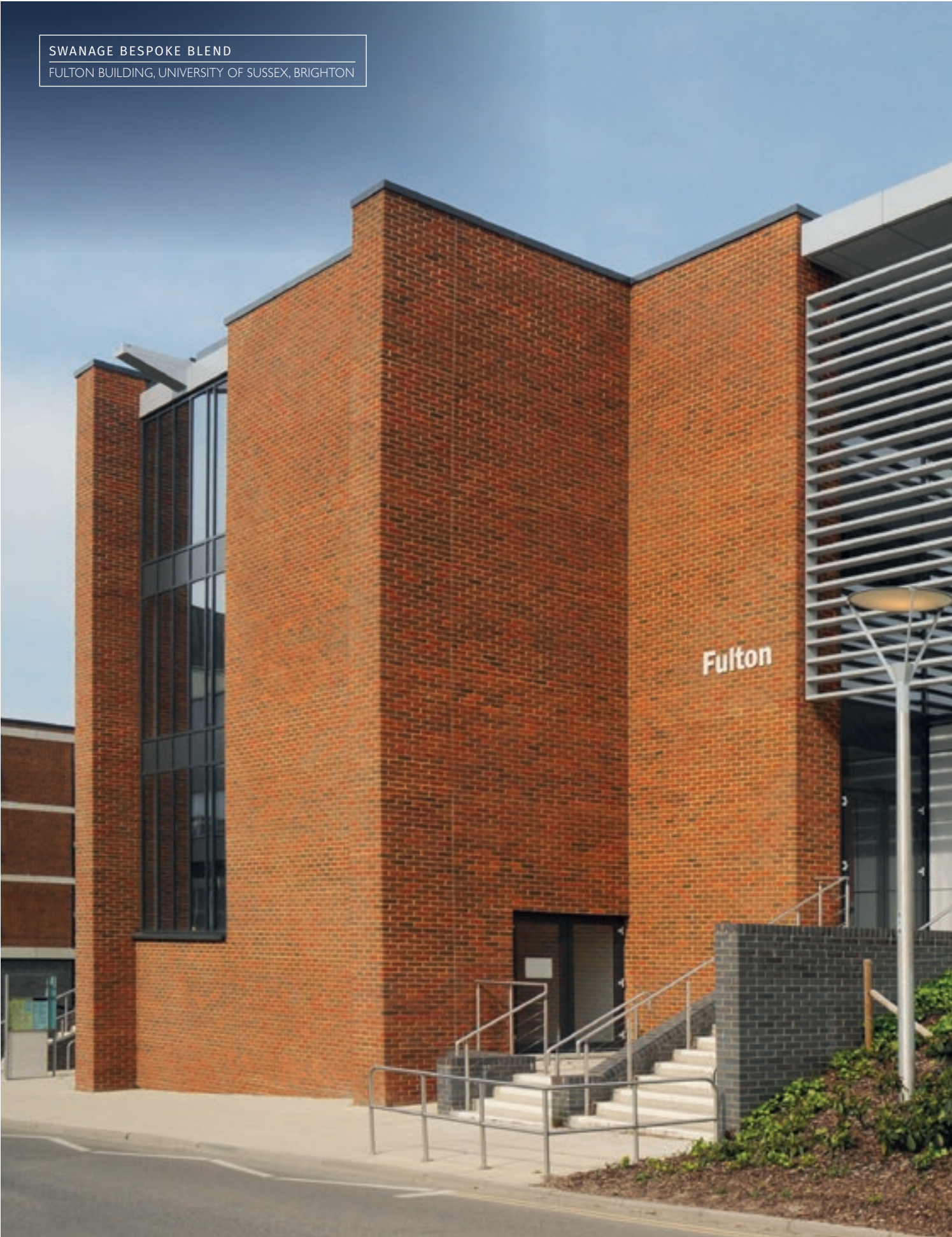
SWANAGE BESPOKE BLEND FULTON BUILDING, UNIVERSITY OF SUSSEX, BRIGHTON