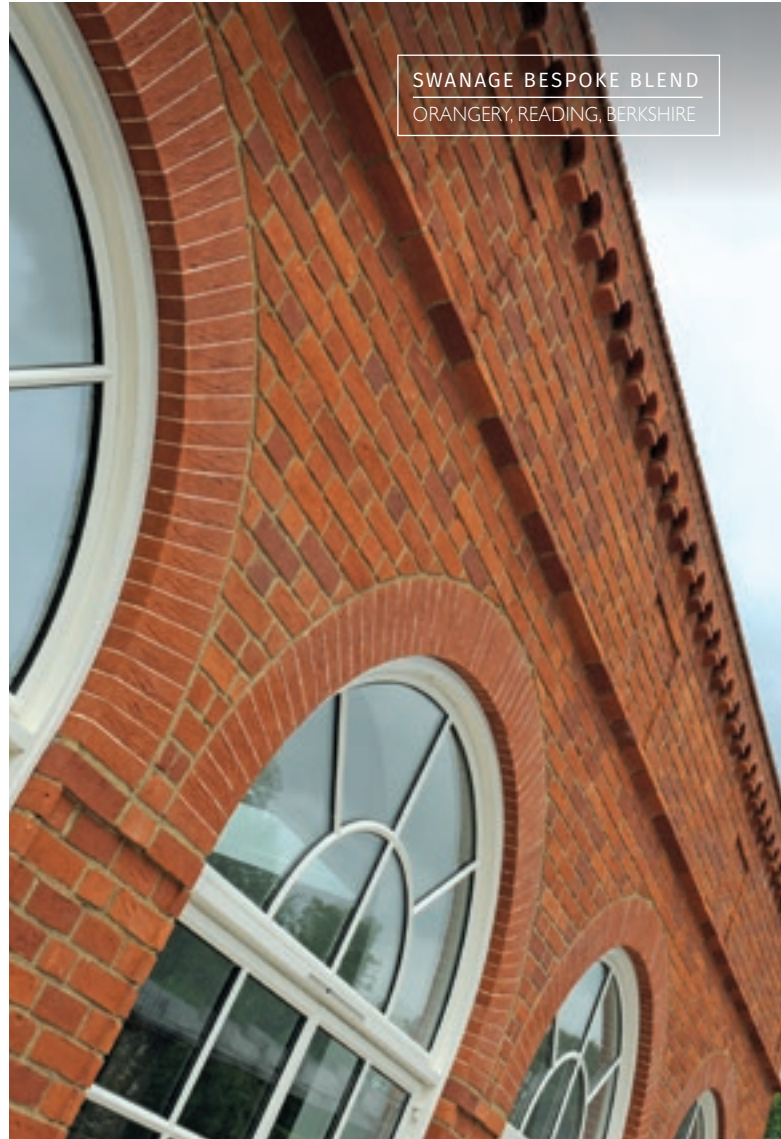
SWANAGE BESPOKE BLEND ORANGERY, READING, BERKSHIRE