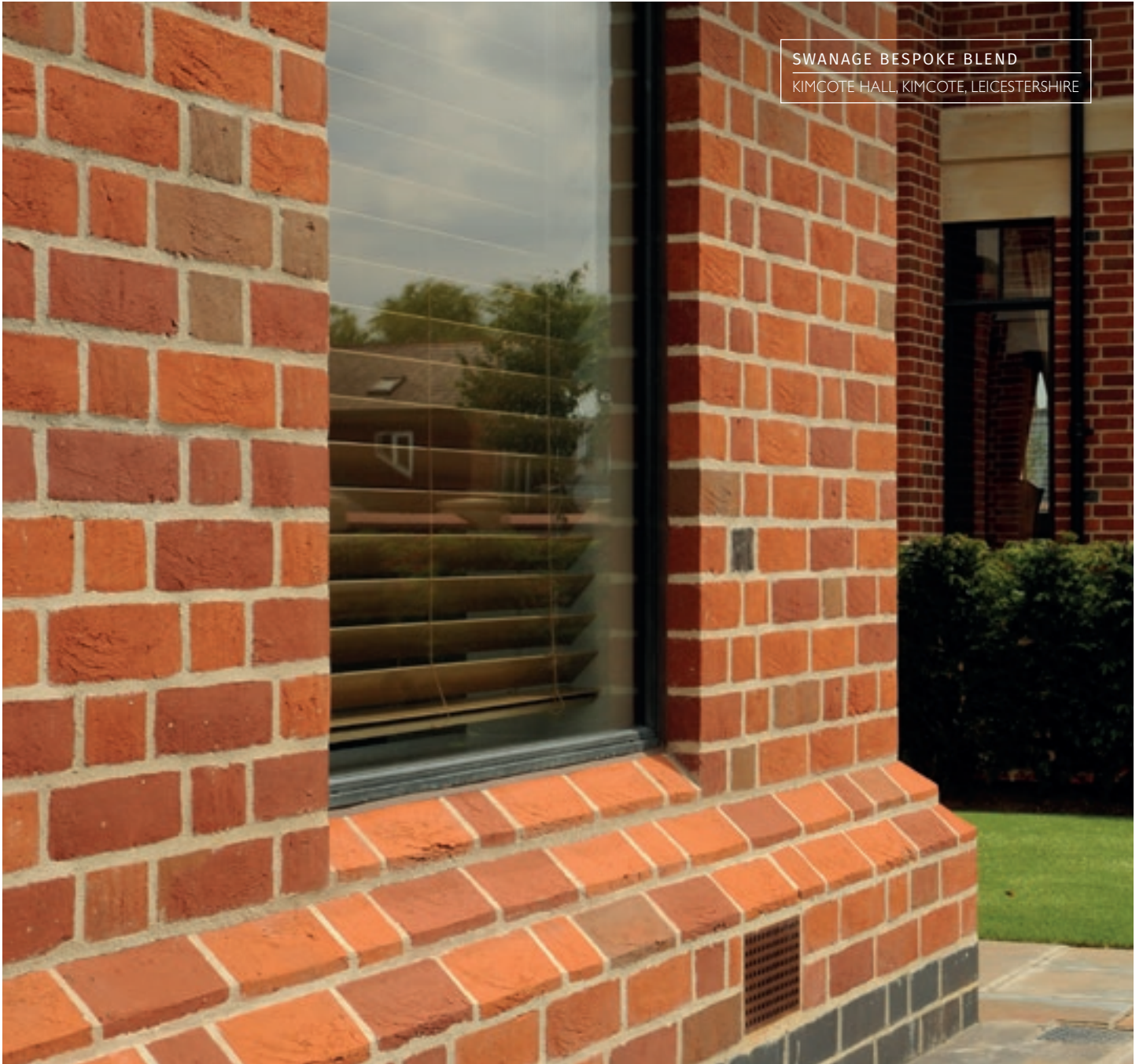
SWANAGE BESPOKE BLEND D