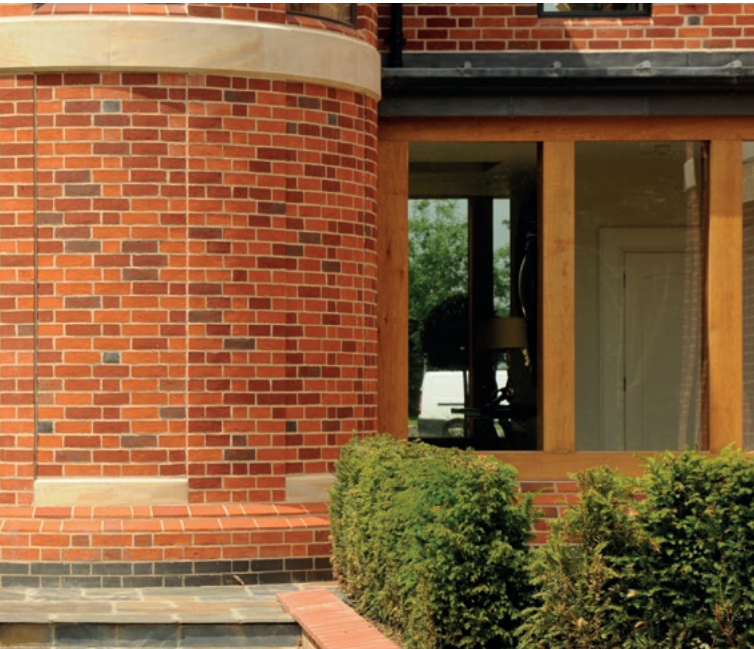
SWANAGE BESPOKE BLEND B (IMPERIAL FORMAT)