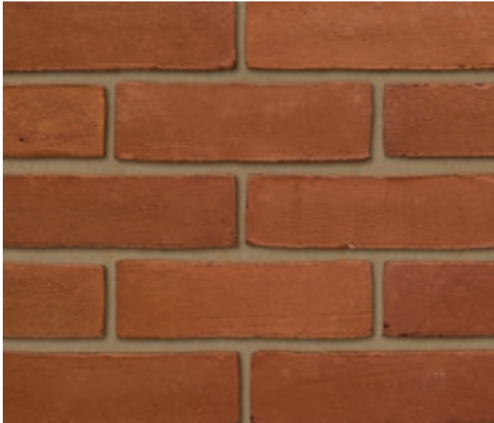
SWANAGE IMPERIAL LIGHT STOCK 68MM