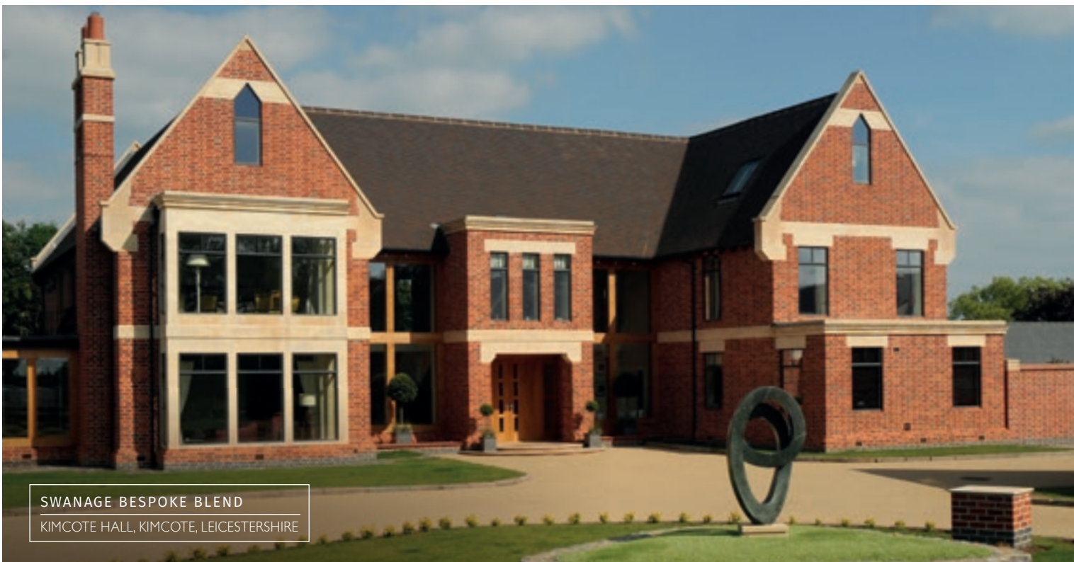
SWANAGE BESPOKE BLEND KIMCOTE HALL, KIMCOTE, LEICESTERSHIRE