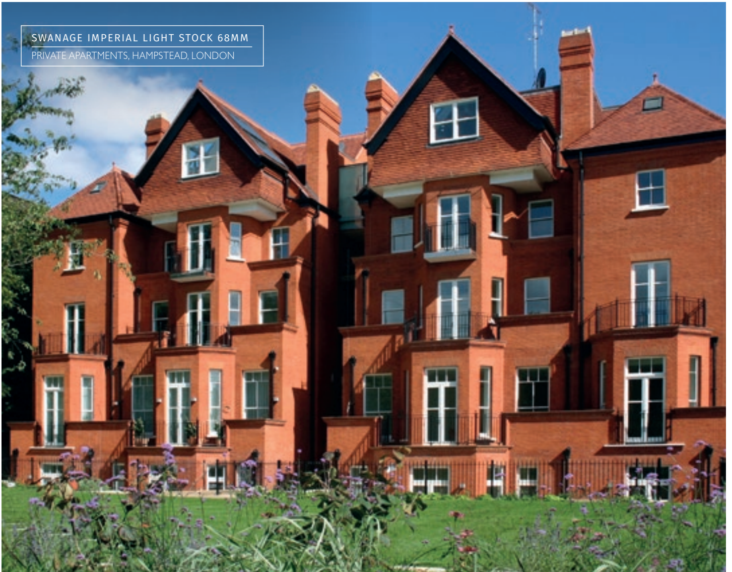
SWANAGE IMPERIAL LIGHT STOCK 68MM PRIVATE APARTMENTS, HAMPSTEAD, LONDON