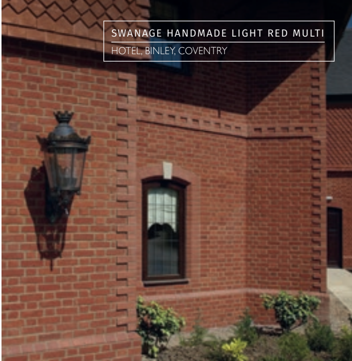
SWANAGE HANDMADE LIGHT RED MULTI HOTEL, BINLEY, COVENTRY